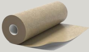
TNT tessuto non tessuto precollato Pre-glued non-woven fabric TNT

Supporto disponibile per cartelle Available support for wooden sheet