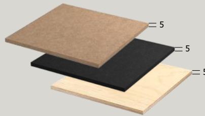
Pannello MDF Ignifugo - Idrofugo - CARB2 Pannello MDF pasta nera MDF panel Fireproof - Waterproof - CARB2 Black MDF panel Pannello multistrato Multi-layer panel

Supporti disponibili per pannelli flessibili Available supports for flexible panels