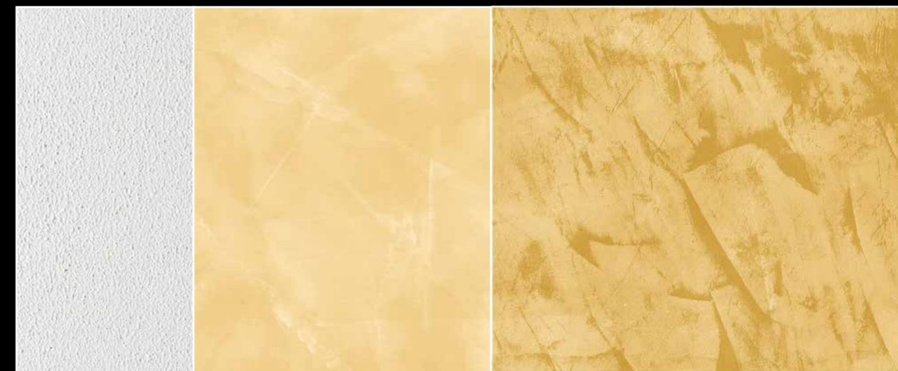
rialto zip application of one coat by roller