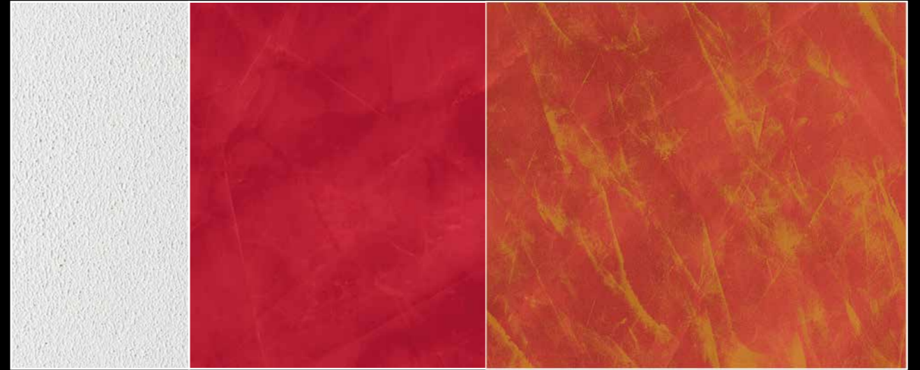
rialto zip application of one coat by roller