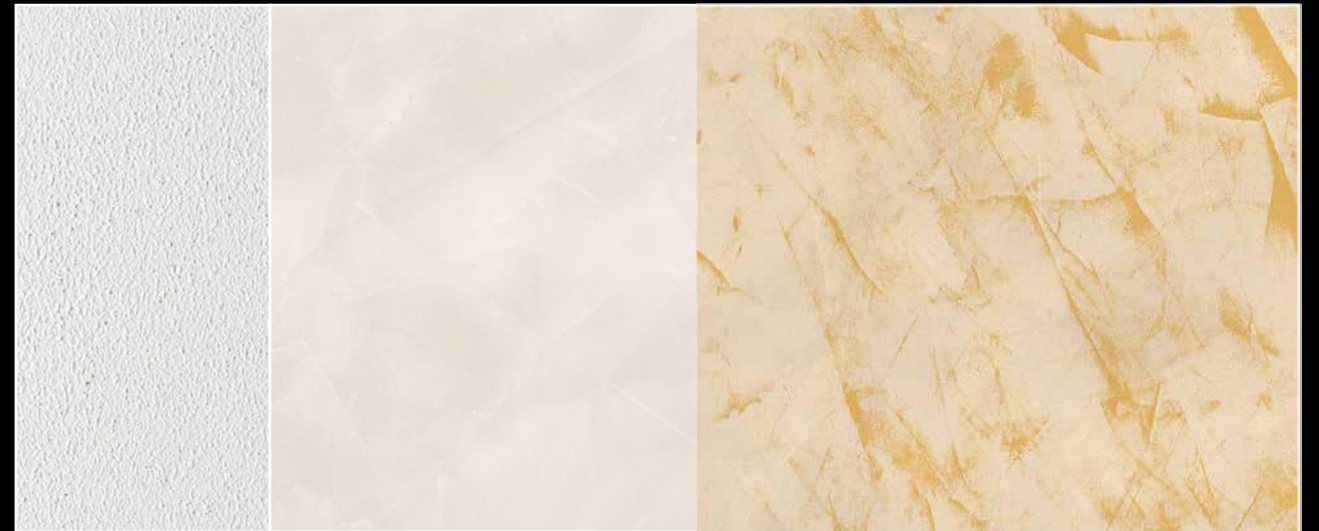
rialto zip application of one coat by roller